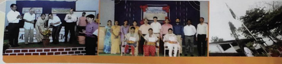
Activities In The Campus....