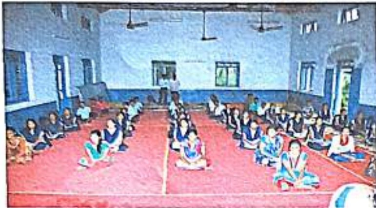
" VALUE ADDED COURSE ON YOGA" 2016-17