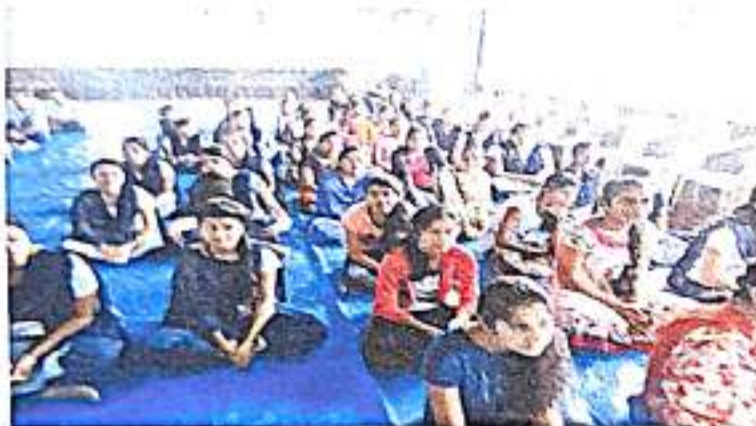
" VALUE ADDED COURSE ON YOGA" 2017-18